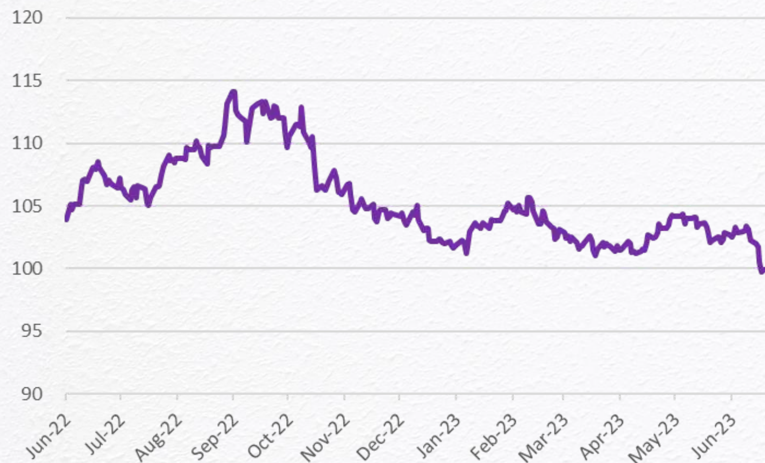
US Dollar Index

The advances in Indonesian stocks were inline with emerging market stocks which outperformed developed markets. MSCI EM increased 4.9% last week compared to MSCI World which increased 1.9%. MSCI China gained 6% as PBoC officials hinted at further demand-side easing of property