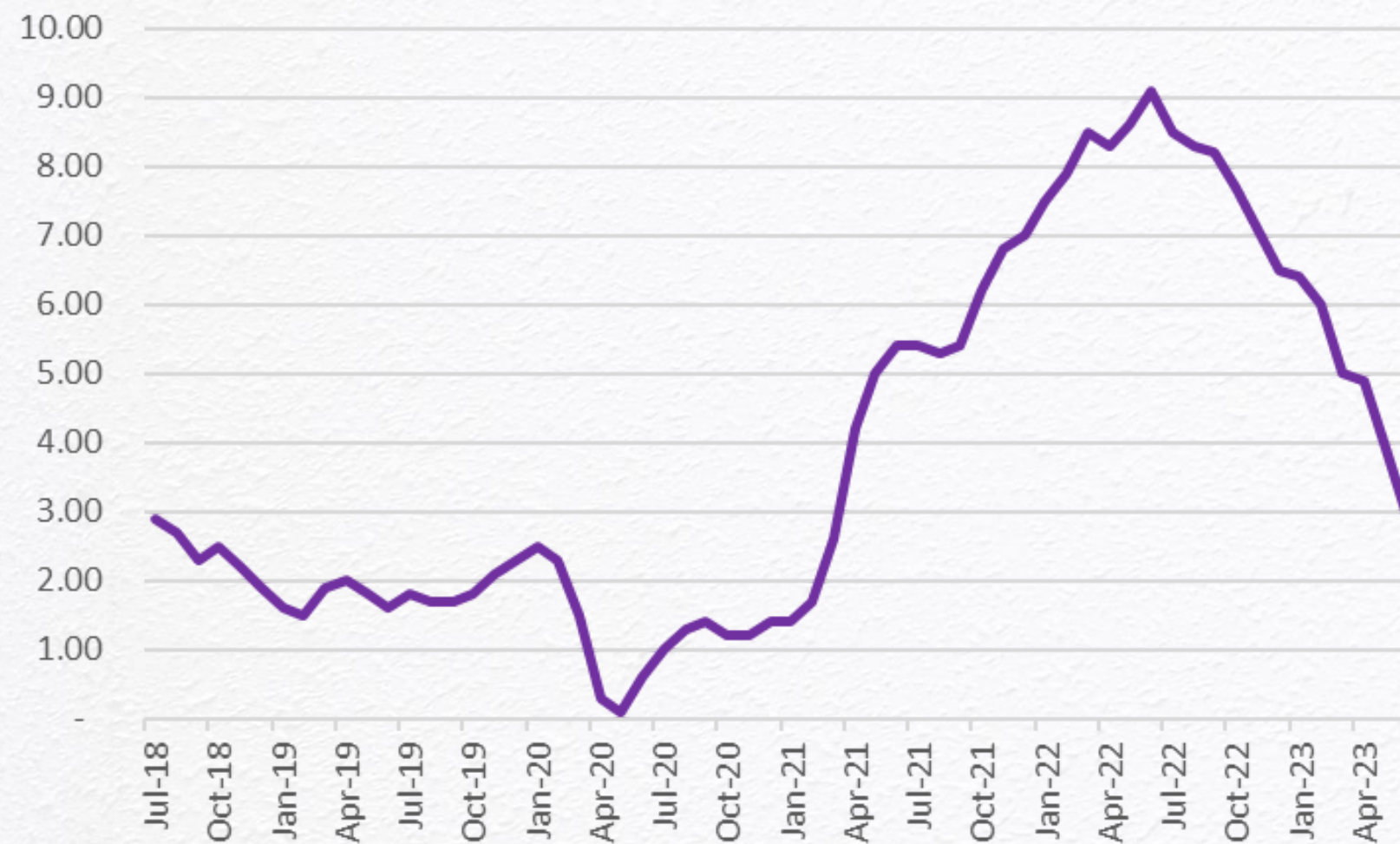
US CPI YoY

buy of IDR 81.2 tn or 15.4% of total outstanding.