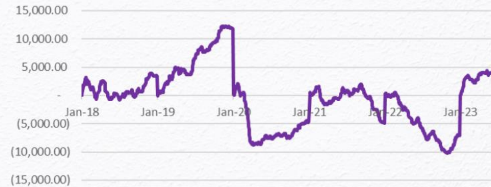
Foreign Inflow Into Indonesian Bonds Ytd

We continue to maintain our positive view of domestic bond market and buying the dip given some factors, including low supply risk, lower inflation pressure, relatively stable currency & attractive valuation compared to peers' country, which can bring more inflows and still ample liquidity.